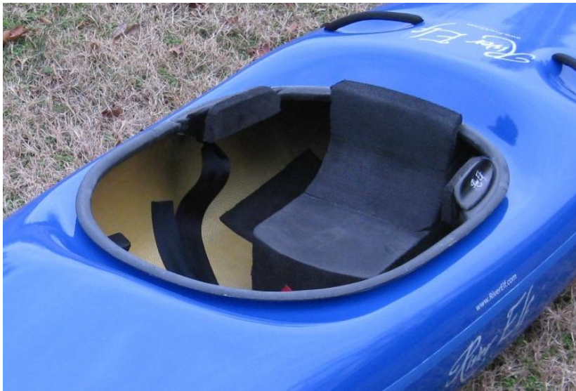
our standard 6" foam pedestal installed

Seat height is generally a choice of personal preference. Higher seats offer better comfort and more reach while lower seats provide for improved stability. The Storm Chaser can be outfitted with either. Something in the range of 5-8 inches is typical. Unless otherwise requested, we normally ship factory installed seats at 6". Let us know if you want something different when ordering.