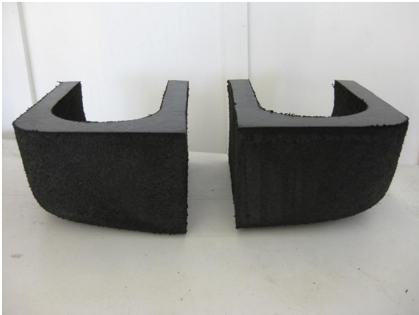
example of “prepped” knee cups ready to be installed

We offer detailed installation instructions on our website for prepping the squared knee cups and for final gluing.